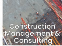
Construction Management & Consulting

Aloha Construction is a Native Hawai'ian owned and operated construction company on the island of Kaua'i. Our mission is simple: To build with integrity, excellence and Aloha.